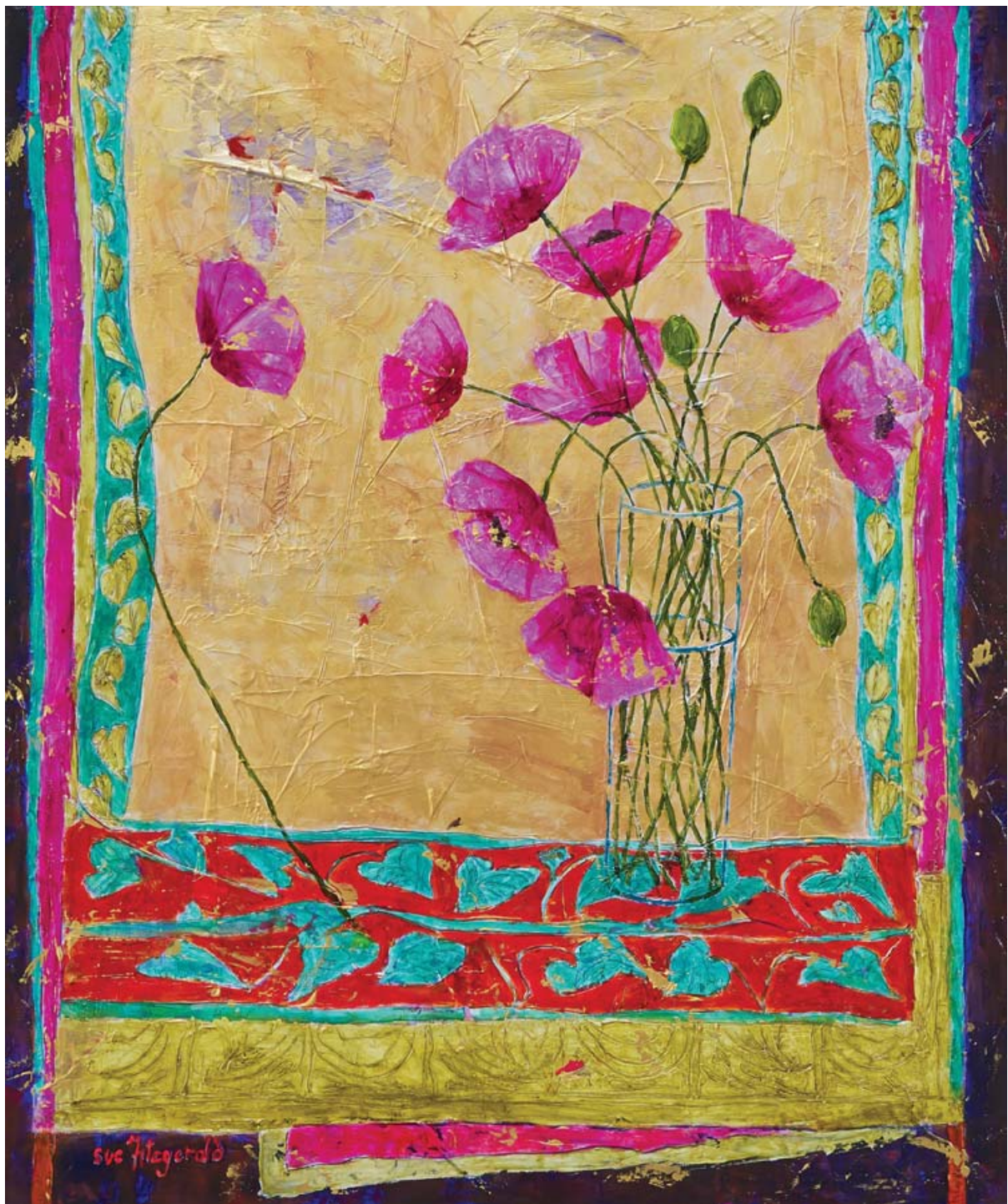
Poppies & Sari Silk, 60 x 50cm