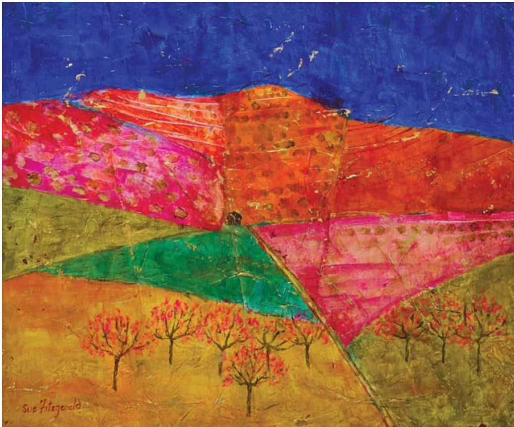
Peach Trees and Vines near St Bazille, 50 x 60cm