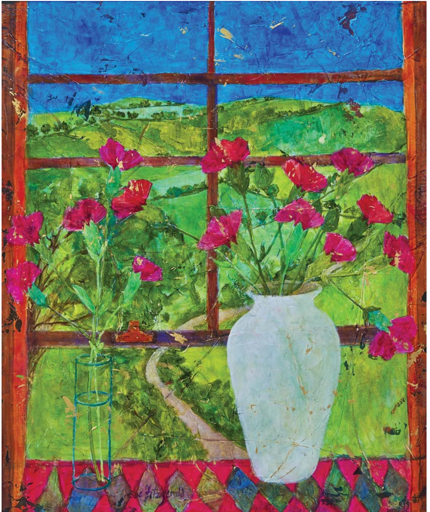
Lane in the Weald, Kent, 60 x 50cm