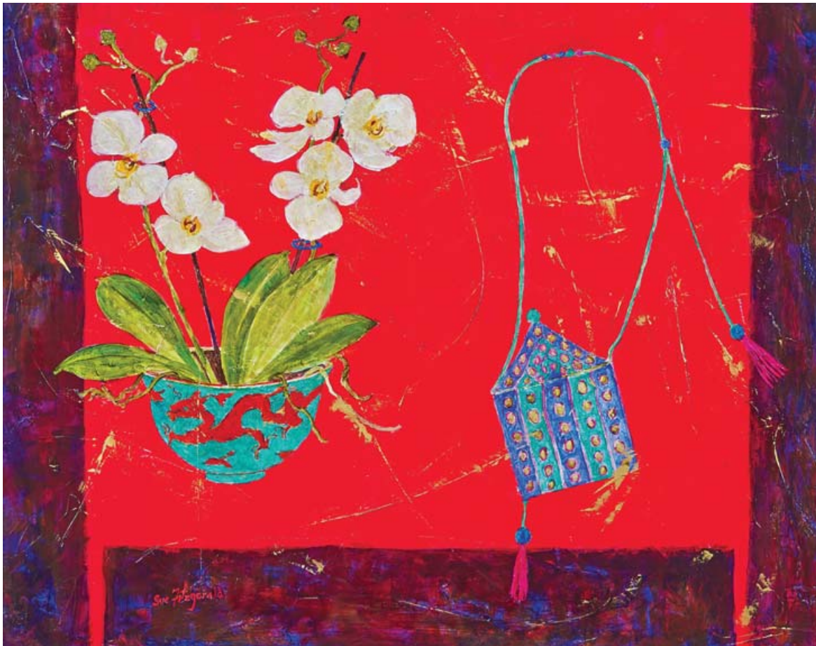
Red Lacquer Table, 60 x 75cm