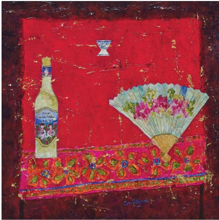
Treasures from Distant Lands, 49 x 49cm