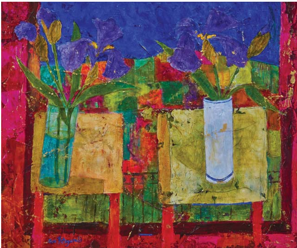
Spring, Languedoc Roussillon, 49 x 59cm