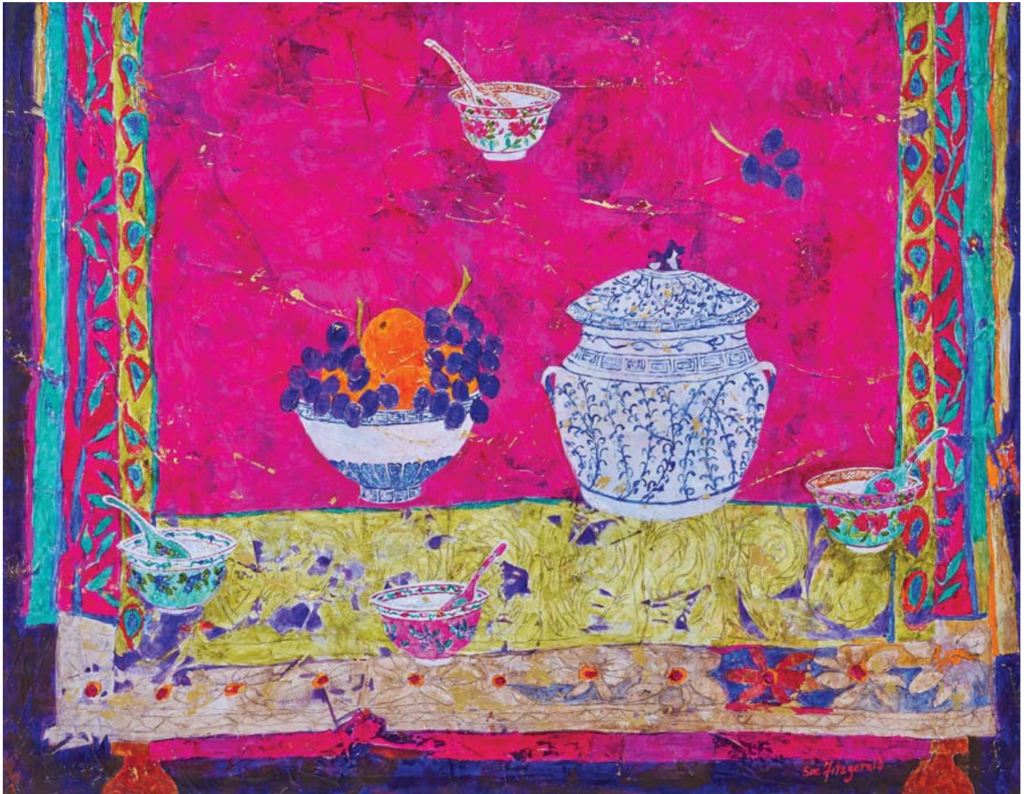
Pre-Theatre Lunch, Victoria Theatre, Singapore, 70 x 90cm