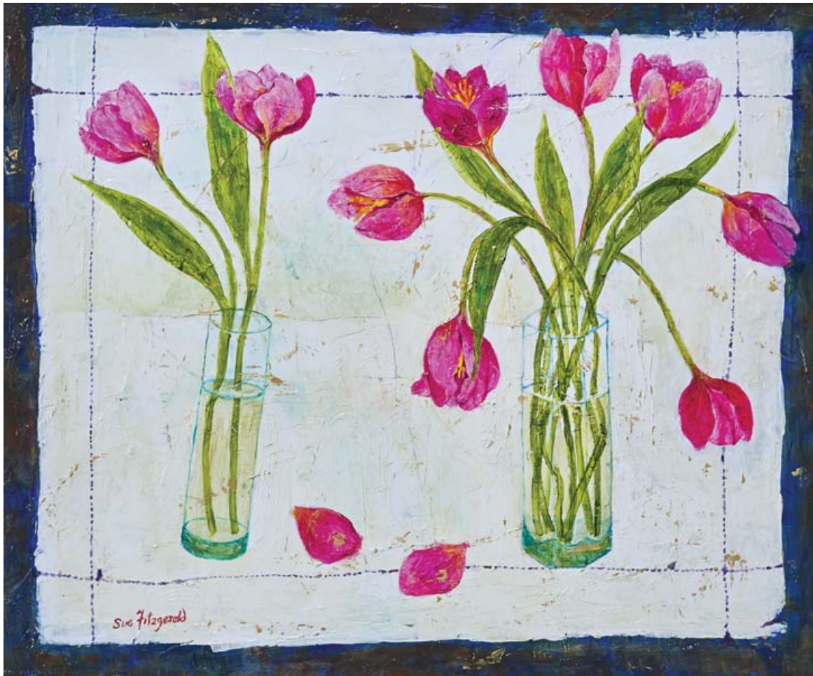
Tulips, 50 x 60cm