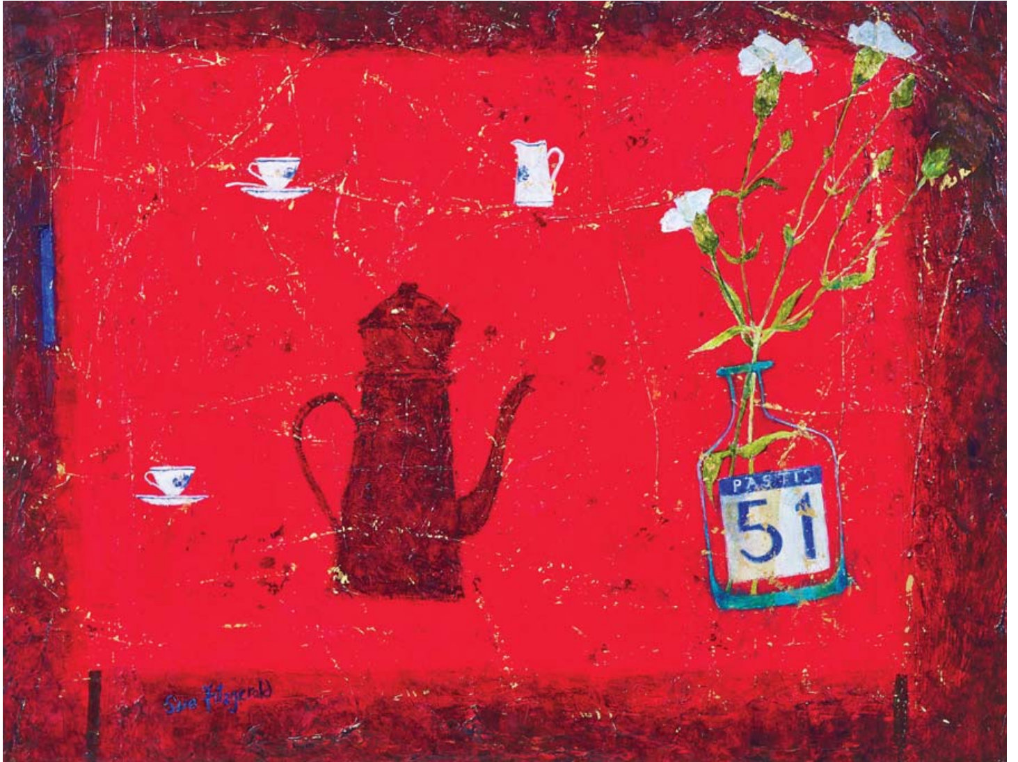
Coffee in Rue des Rosiers, Paris, 70 x 90cm