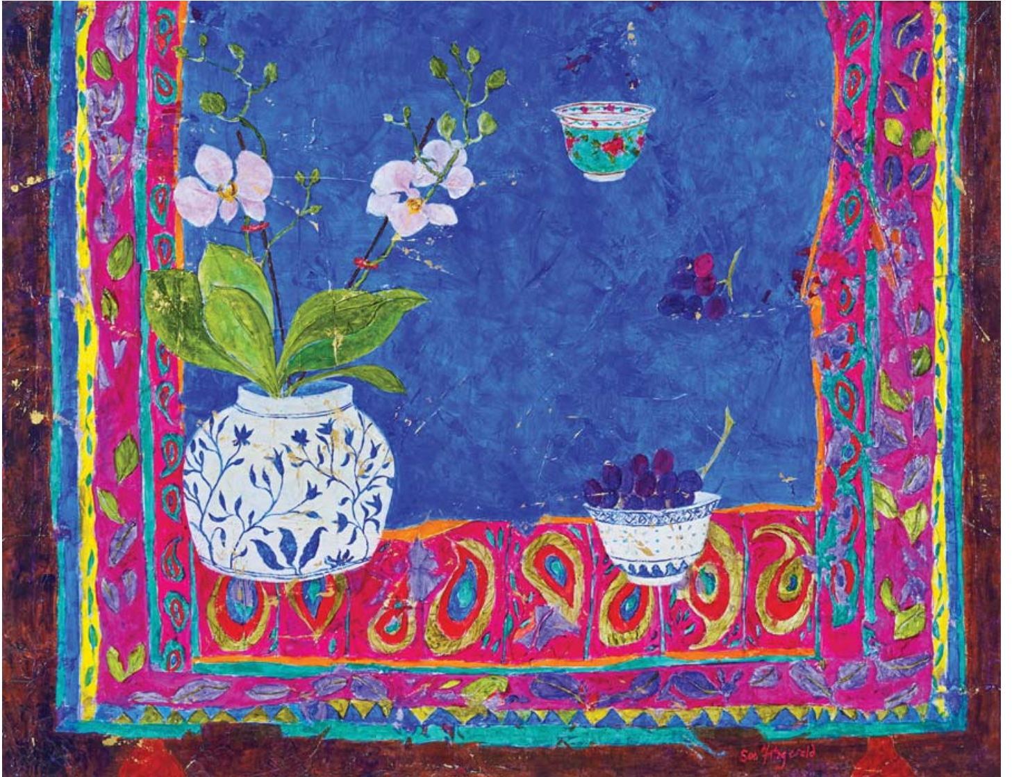
Cobalt Silk and Orchid, 70 x 90cm