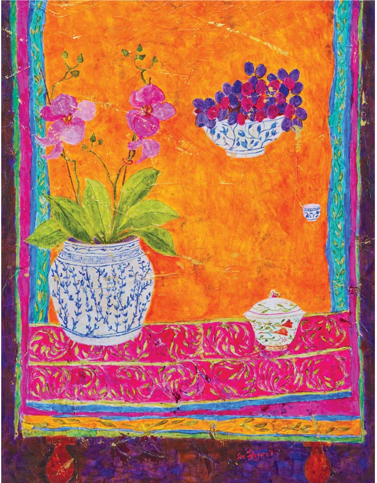
Saffron, 90 x 70cm