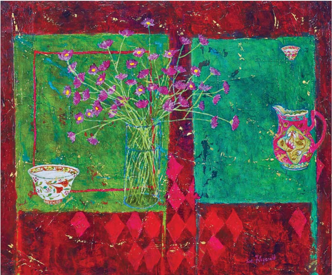
Tables and Tea Bowls, 50 x 60cm