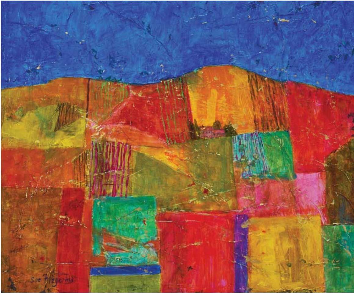
Vines in Late Summer: Clemont l'Hérault, 50 x 60cm