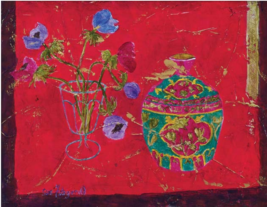
Paranakan Wedding China and Anemones, 34 x 45cm