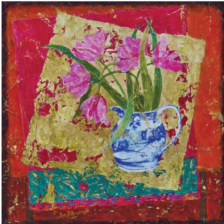
Silks from Lodeve Brocante, 49 x 49cm