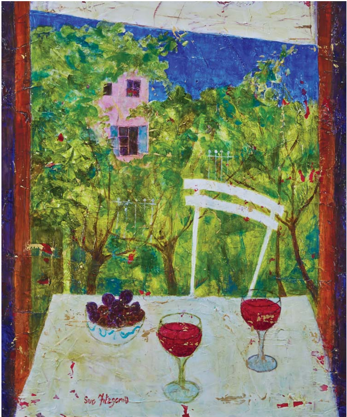
Wine and Olives: St Bazille de la Sylve, 60 x 50cm