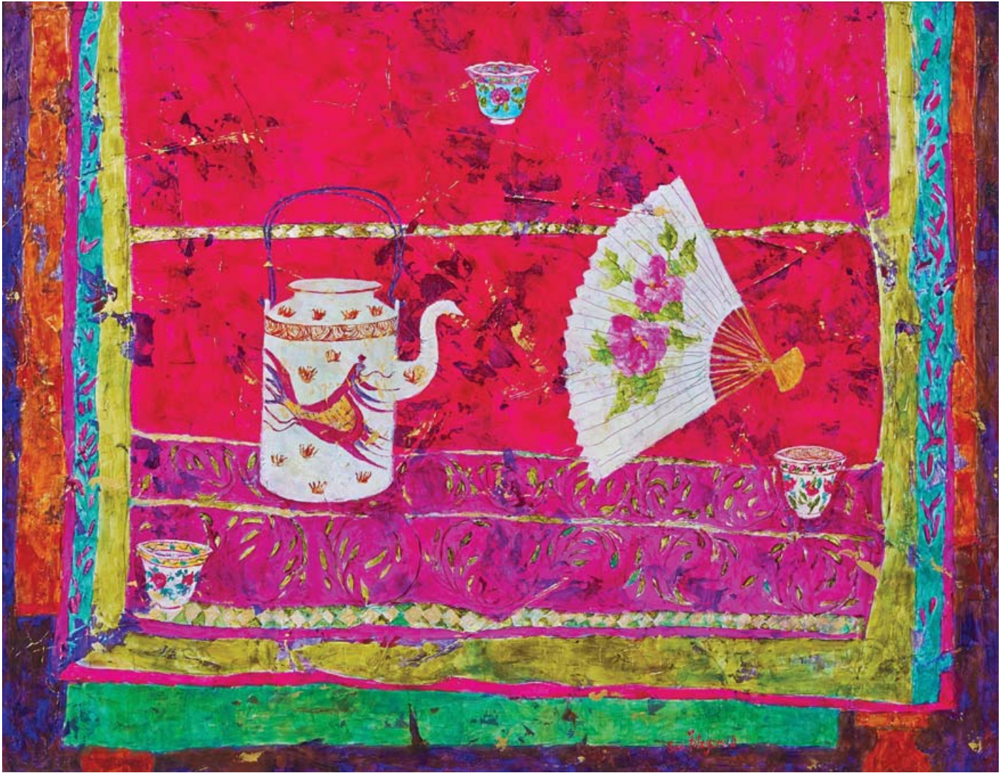
Tea on the Verandah, Singapore, 70 x 90cm