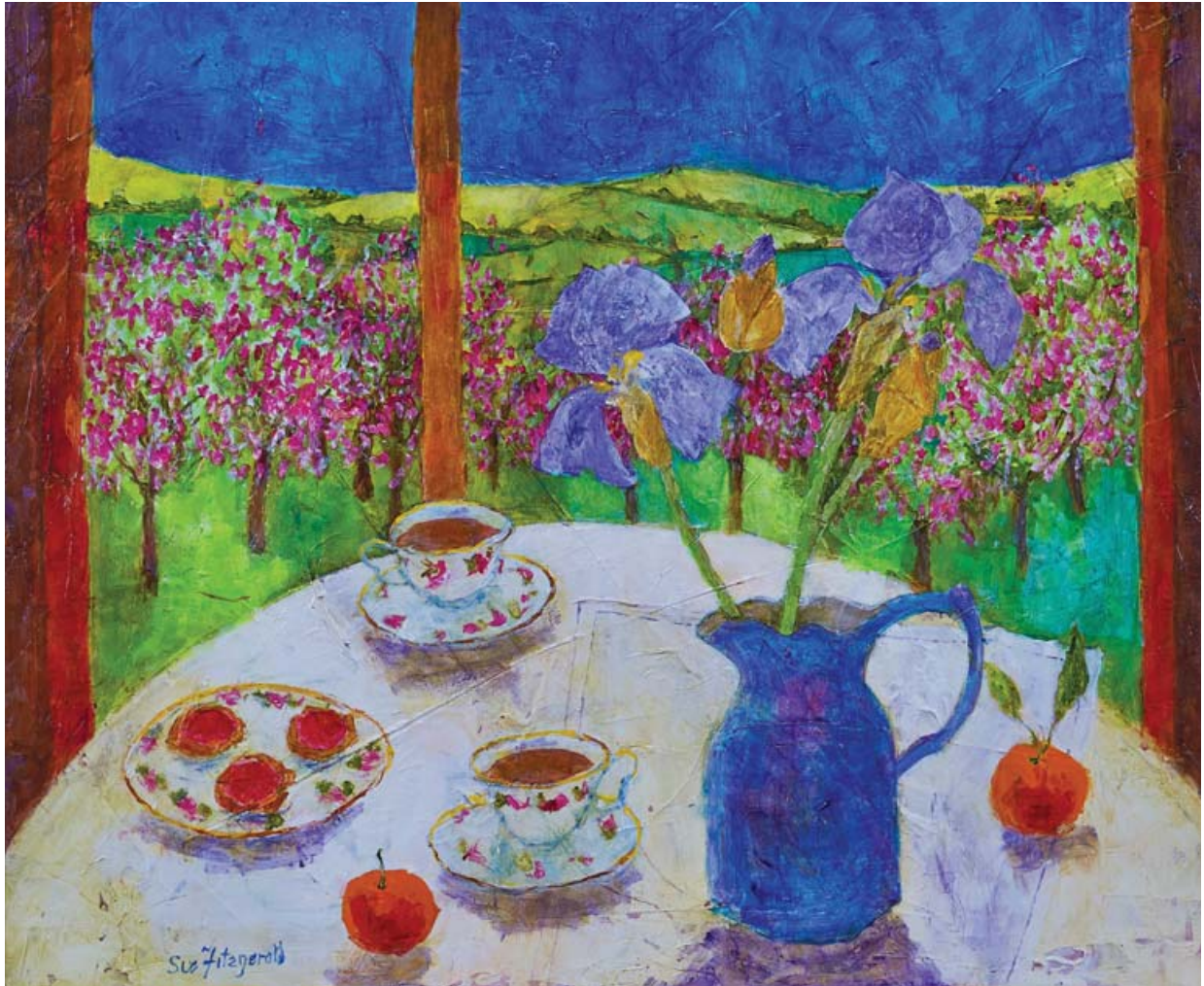
Apple Orchard in Wye, Kent, 50 x 60cm