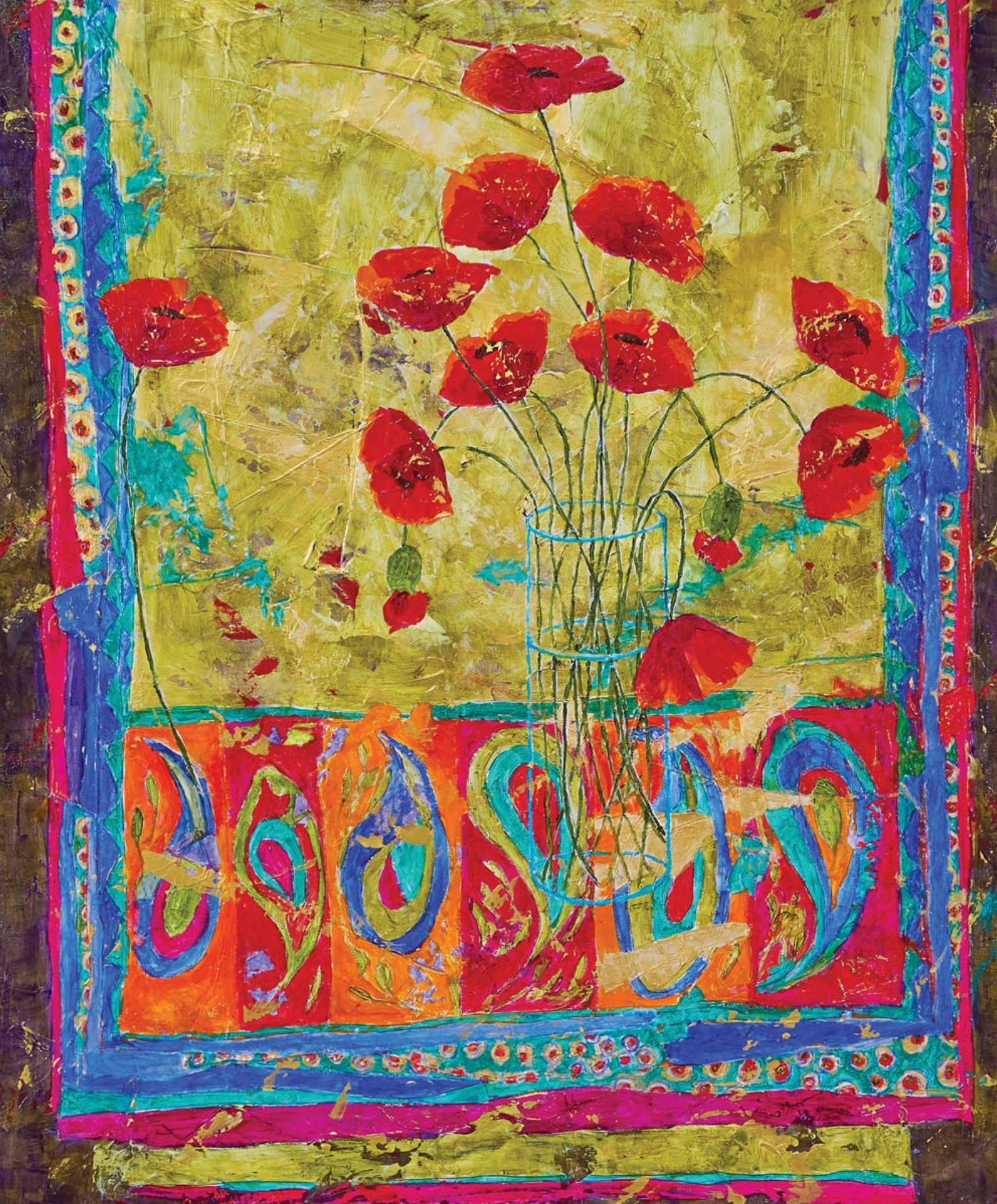
Golden Poppies, 75 x 60cm