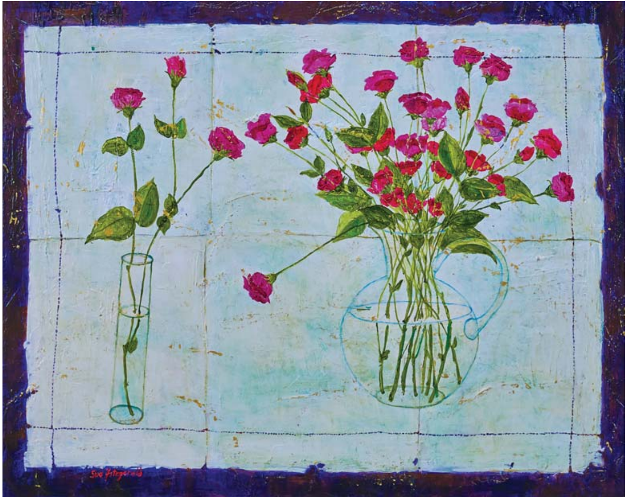
Linen, 60 x 75cm